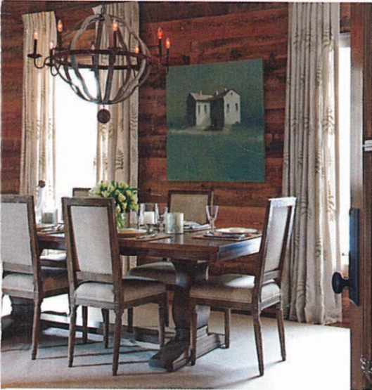
THE NEW LOOK OF COUNTRY DECORATING