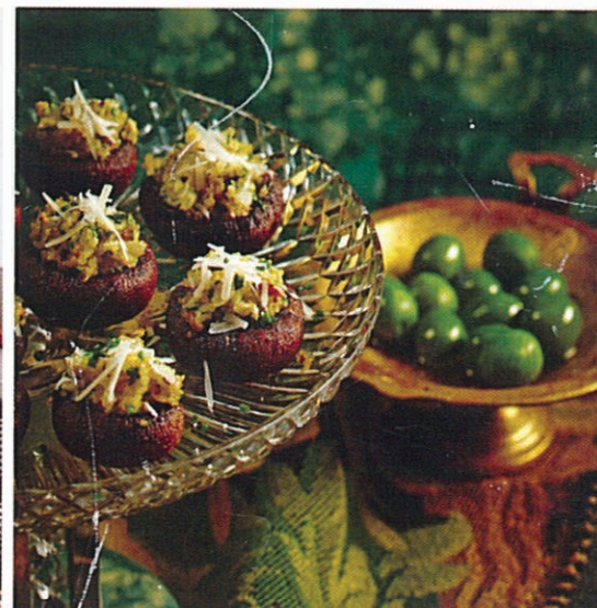
VINTAGE STYLE FOR THE HOLIDAYS